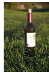
Stainless Steel Wine Bottle Holder