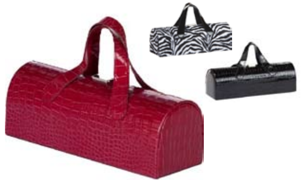
Carlotta Wine Clutch