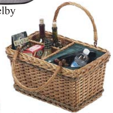
Trivoli Market Basket